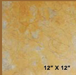
12" X 12"