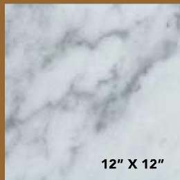
12" X 12"